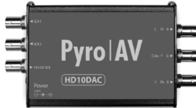
HD10DAC HD/SD SDI to Analog PVC-930 $50 Mail-In-Rebate